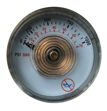
Contact PIC Gauges for configurations and ordering information